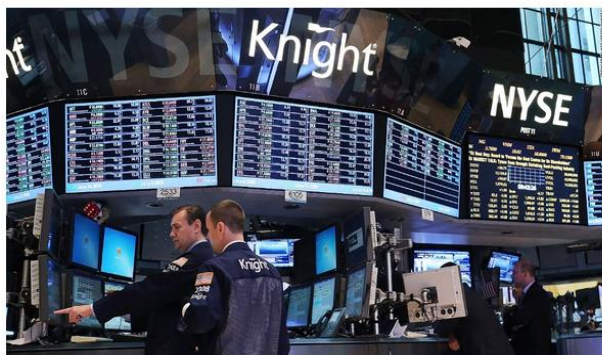
Knight Capital's computer bug cost the firm $440 million, making it one of history's most expensive software glitches.